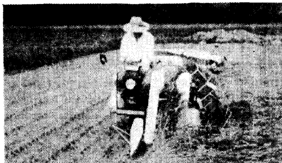
Rice harvesting in Japan

In other words, the Japanese demonstrate a deep sense of history probably unmatched by any other people anywhere in the world. This sense of history, this strong consciousness of the past,