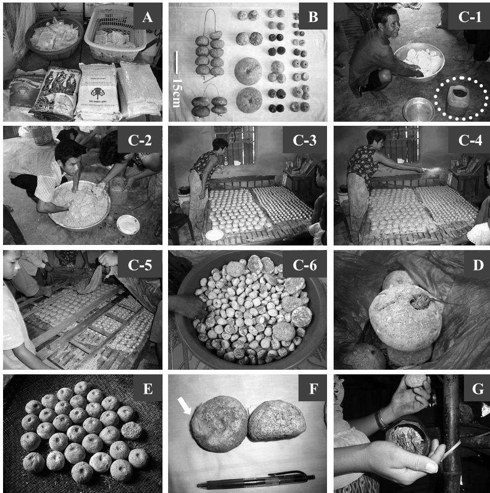
Fig. 2 Fermentation Starters in Cambodia

Note: Starters imported from Vietnam and China are sold in the market (A). A variety of homemade starters from Cambodia (B). The production process: preparing and mixing ground rice and plants (dotted circle) (C-1 and C-2), blowing rice liquor by mouth (C-3), scattering powdered old starters (C-4), placing a few planks across a bed and covering the new starters with mosquito nets for two nights (C-5), and the products after drying in the sun (C-6). A capsicum fruit put into a starter (D). Depressing the centers of starters (E). Putting kateh (cotton; indicated with the arrow) onto the starters while making a wish that mold will grow on them like the cotton (F). Starters kept in a bamboo container with capsicum fruits as an insect repellent (G).