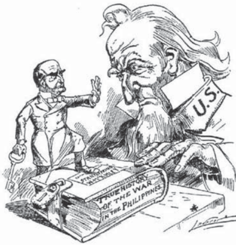
Fig. 1 "The Forbidden Book"