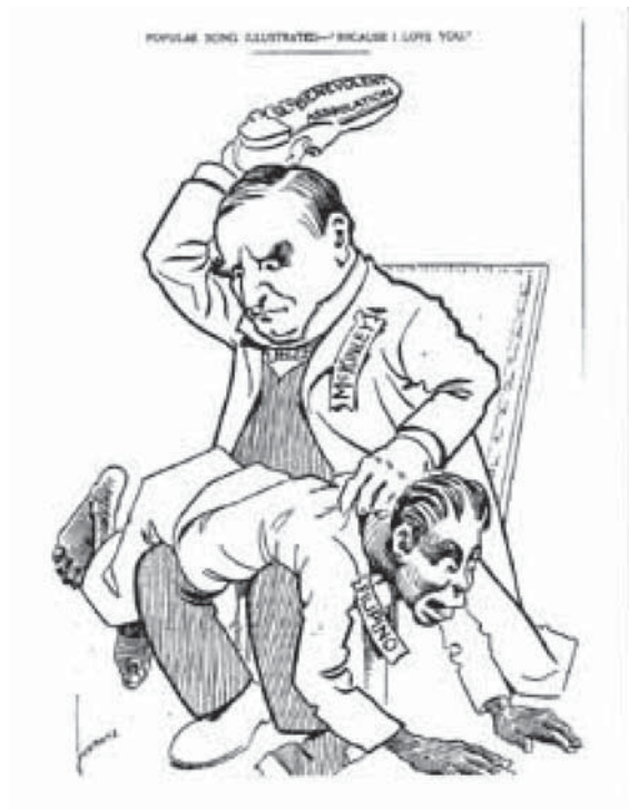
Fig. 5 “Popular Song Illustrated—“Because I Love You”” Reprinted in Ignacio et al. [2005: 103].

This labor of sanitizing the violence of colonial conquest was certainly evident in the early years of the war [see Iletto 1995: 51-82; Warwick Anderson 2006: 83-112]. While the U. S. press and public reacted with horror to the atrocities visited upon Filipinos by the U. S. military, U. S. officials and the members of the second Philippine Commission (headed by future president William H. Taft) attempted to frame the violence of war in domestic metaphors and the discourses of civil society. Countless political cartoons of the period attest to the domestication of violence in paternalistic metaphors of discipline, education, and hygiene (see Figs. 5-7 “Because I love you,” “School,” and “The Filipino’s First Bath”). These metaphors interfaced with the continuation of the war through military as well as civil institutions. 41) Yet the trajectory of this rhetoric led not to the political historicism of race war we saw earlier, but rather the suppression of war in both the U. S. and Philippines, through metaphors and the discourses of civil institutions. With the 1902 “Sedition Act” classifying any and all signs of revolutionary activity as a civil crime, the criminalization of war