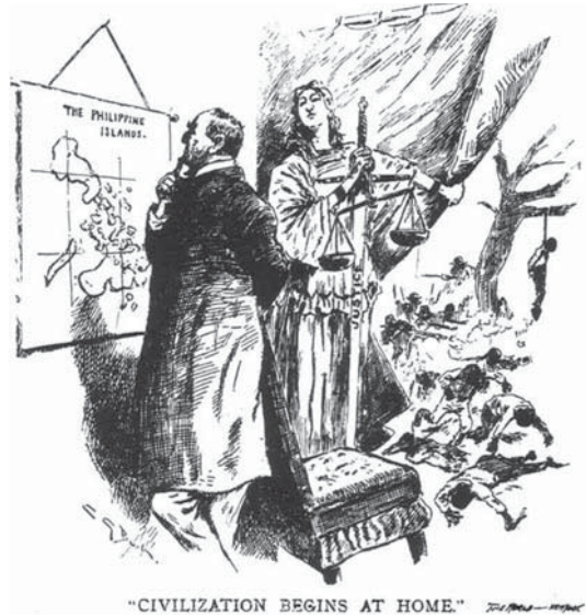
Fig. 4 “Civilization Begins at Home” Source: The Literary Digest 27: 22 (November 26, 1898). Reprinted in Ignacio et al. [2005: 86].

the Philippines, and narrate the new episode of imperial conquest as the concluding chapter to the unfinished racial conquest of whites over blacks and native Americans.