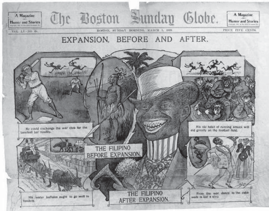
Fig. 2 “Expansion, Before And After”

Blacks, Bative Americans and Filipinos all became tied up in the symbolic matrix of U.S. paternalism, often to the point of being identified with one another by the racist press.