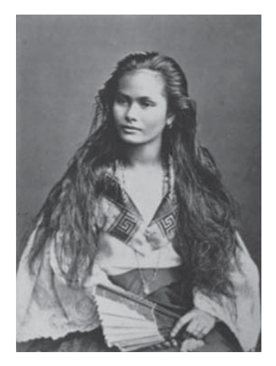
Fig. 2 Digital Reproduction of Indigena de la Clase Rica, Photographic Print by Francisco von Camp.

Source: [http://es.wikipedia.org/wiki/Fotograf %C3%ADa_en_Filipinas] (accessed March 23, 2011)