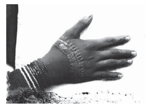
Fig. 7