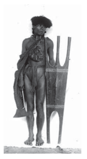
Fig. 6