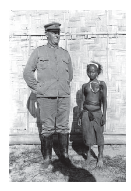
Fig. 5 Photograph from the Collection of Dean Worcester